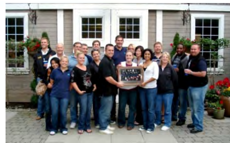
TRI employees showing off our 15 year timeline

Thanks everyone for making it so special. In the spirit of 'the current economy', we toned it down from our 10 year party when we had 70 outside guests and limited this event to company members only. Keep your eyes open for the 20 year!