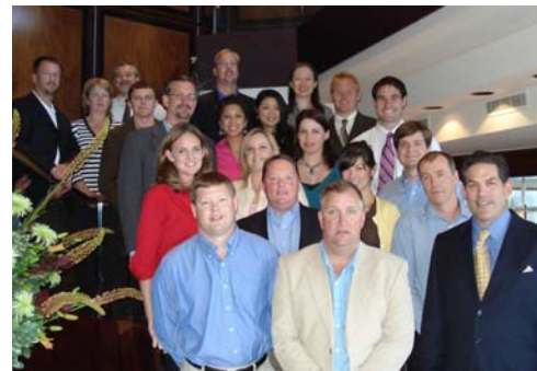
TRI at the Columbia Tower, Seattle, WA